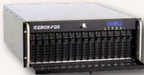
Powerful & inexpensive Data is stored centrally on two N-TEC ICEBOX FQS systems

Additional storage space requirements can be realised by the SAS Expansion Port, which enables the connection of three additional JBODs. LUN addressing occurs independent of host. Dynamic RAID expansion, a so-called online expansion, and migration to a higher RAID level is possible. The ICEBOX also allows automatic rebuilds. The model supports Dual Loop as well as use in